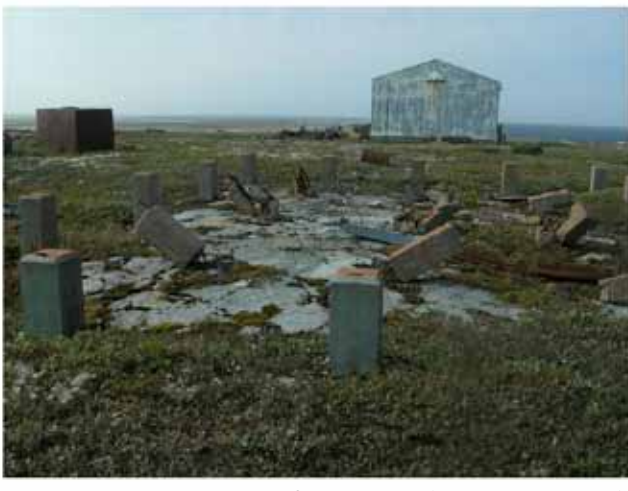
Cape Jones (Pointe Louis XIV)