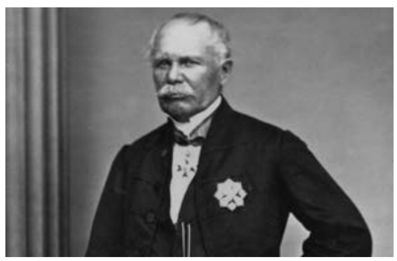
BANQ CALL NUMBER: P560,S2,D1,P1539 Title: Étienne-Paschal Taché - [circa 1865]

Taché's choices reflected his father's political values: Étienne-Pascal Taché was a Patriote who defended the French Canadians within the political institutions of his time. Also, as a backdrop, in response to Lord Durham, who advocated uniting Upper and Lower Canada, most of the political figures whose names Taché chose to have engraved in the woodwork opposed this constitutional formula.