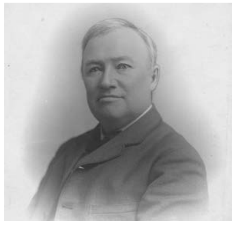
BANQ CALL NUMBER: P560,S2,D1,P1290 Title: Eugène-Étienne Taché / Livernois Québec – [circa 1890]

Of the men whose names were engraved in the woodwork, 29 significantly affected the political life of Lower Canada. These historical figures were not randomly selected: Members who sat in the House of Assembly of Lower Canada are featured in the National Assembly Chamber (Blue Room), while the names of illustrious members of the Legislative Council adorn the Red Room.