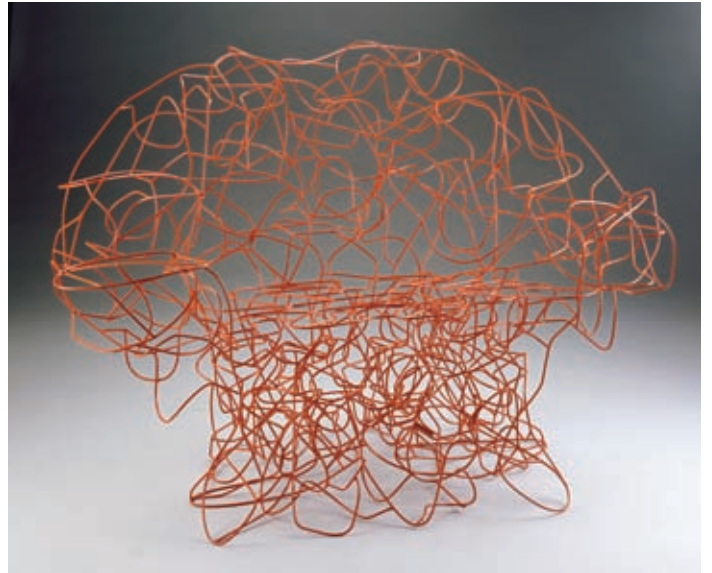
Fernando and Humberto Campana Corallo Chair , 1993-1998 Gift of Edra S.p.A.