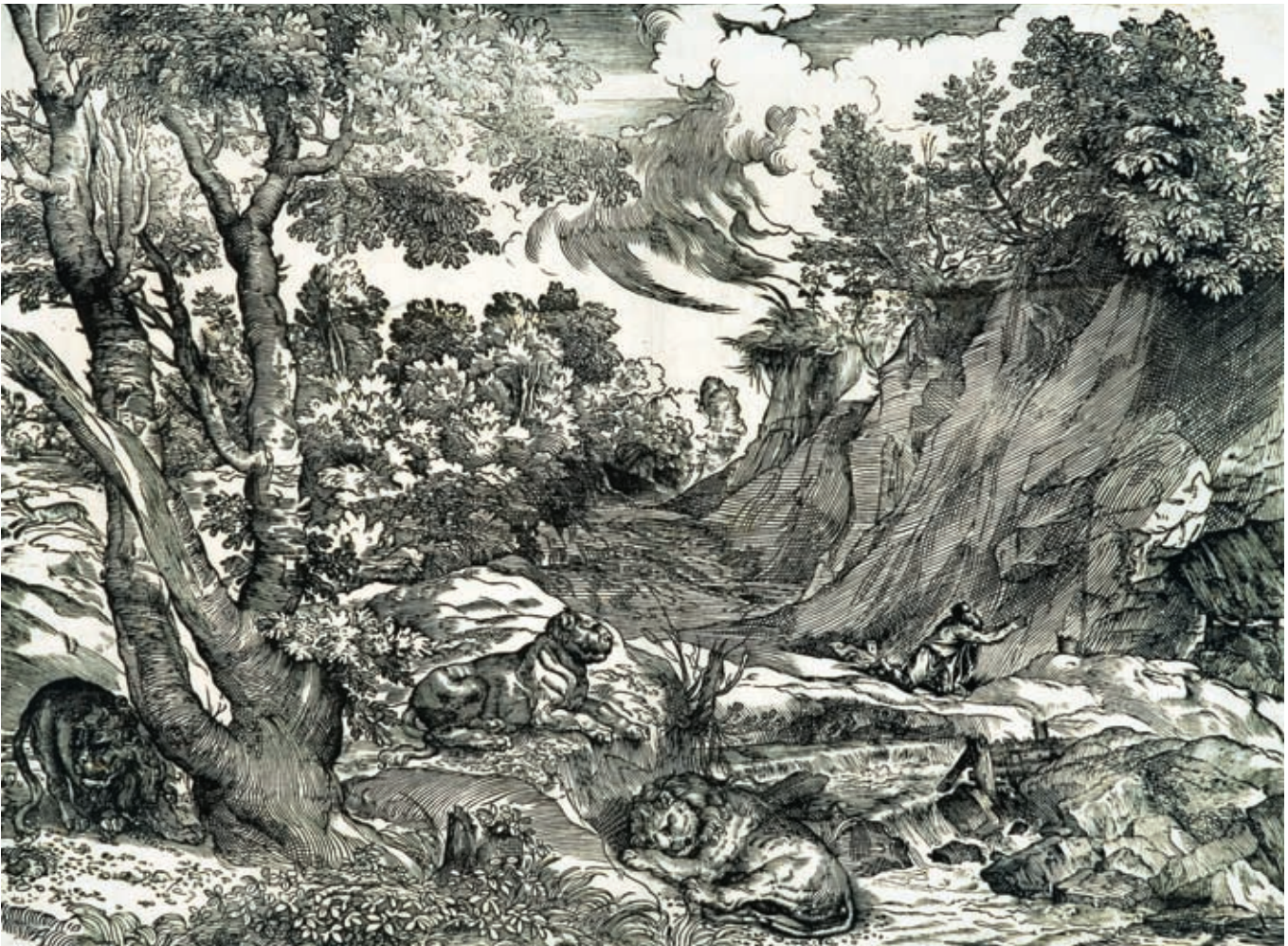
Tiziano Vecellio, called Titian Saint Jerome in the Wilderness, about 1530 Purchase, anonymous fund