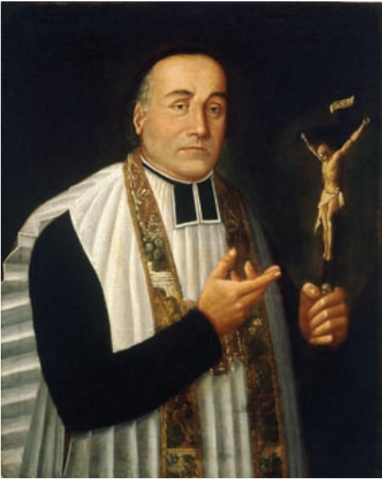
Attribed to Louis Dulongpré François-Xavier Dézéry Latour, the First Canadian-born Curé of the Church of Notre-Dame, Montreal, about 1790 Purchase, Horsley and Annie Townsend Bequest