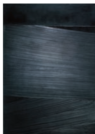
Back cover: Pierre Soulages Painting, 222 x 157 cm, August 24, 1979 (detail) 1979 Anonymous gift